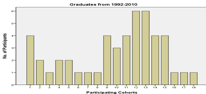
Figure 2. Participating Doctoral Cohorts from 1992-2010

The responses received from the six categories were Curriculum (Mean 4.48), Program Structure (Mean 4.67), Faculty (Mean 4.50), Learning Environment (Mean 4.65), Outcomes (Mean 4.58) and Overall Evaluation (Mean 4.48). The results of the six components indicated support for the cohort program.